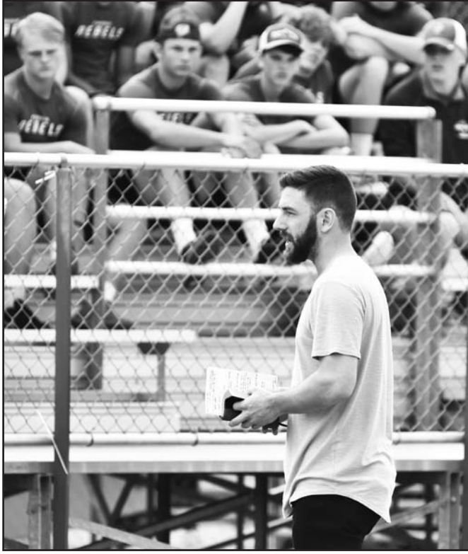
Hwy. 515 FCA hosted a morning devotional for all six teams.